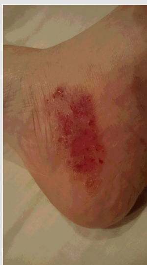
Figure 2: Purpura noted on the left lower limb.